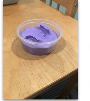
Н u g