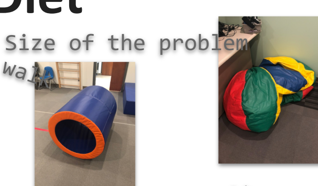
Talk to an Adult